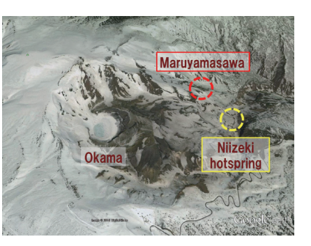
The bird's eye view of Zao volcano

I have considered the possibility of Zao volcano, 40 km southwest of Sendai (photo 6), becoming active as a result of the 2011 Great East Japan Earthquake, and have measured fumarolic temperatures since 2012 at the Maruyamasawa fumarolic geothermal area approximately 2 km northeast of the Okama crater lake,