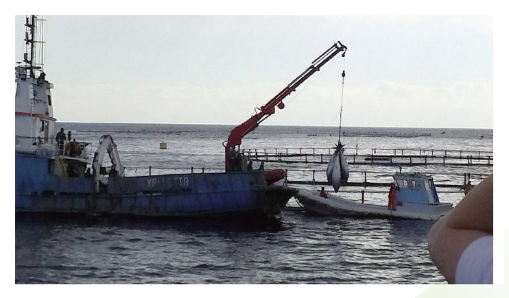
This fish tank is for tuna farming.

Tuna farming catches young bluefin tuna and uses various methods to fatten them up, which allows for a kind of aquaculture where humanmade methods can be used for "high grading tuna."